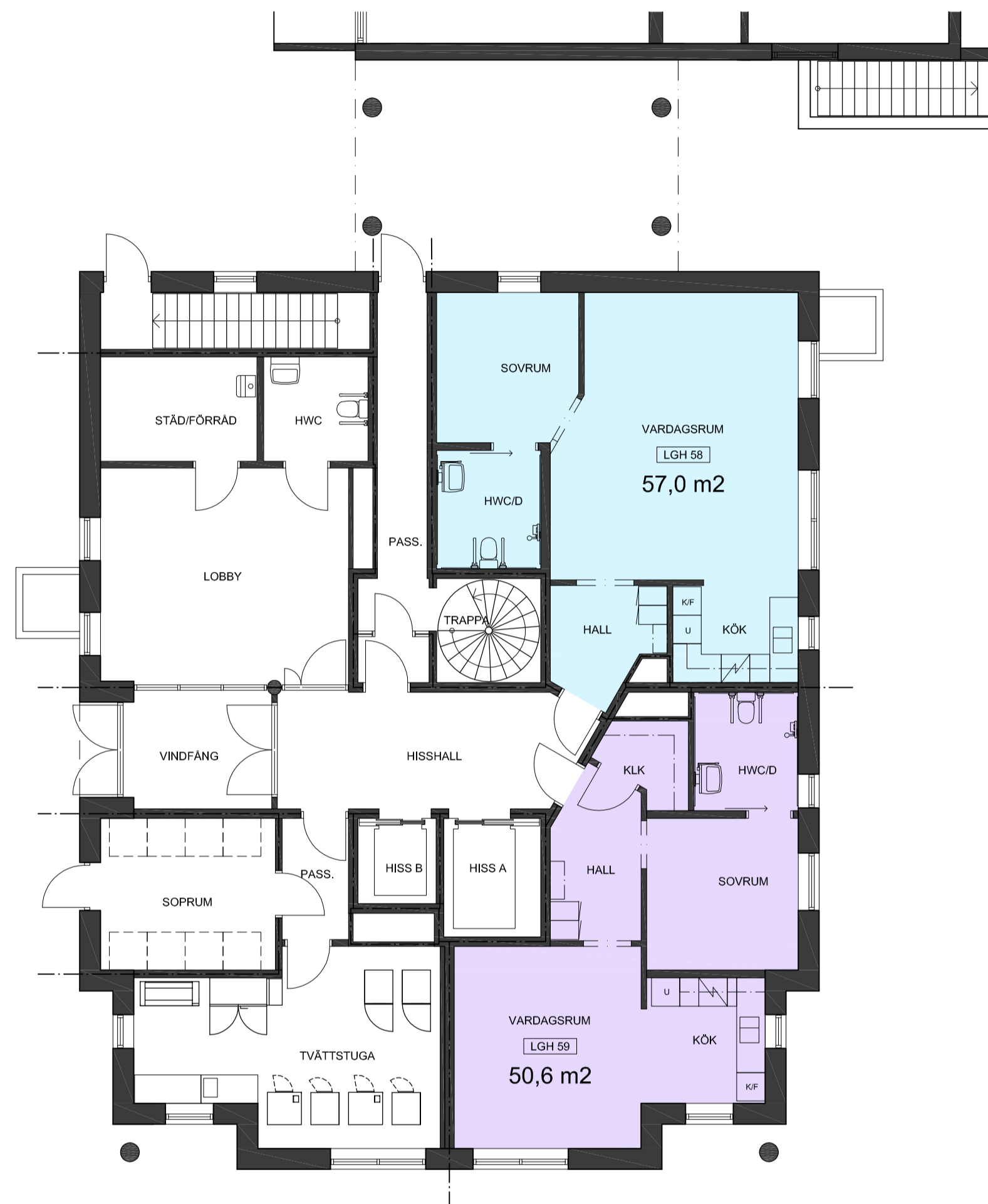
PLAN 1 (BOTTENVÅN)